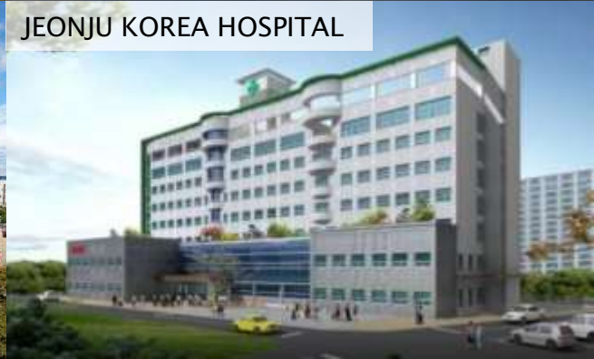
JEONBOOK UNIV HOSPITAL